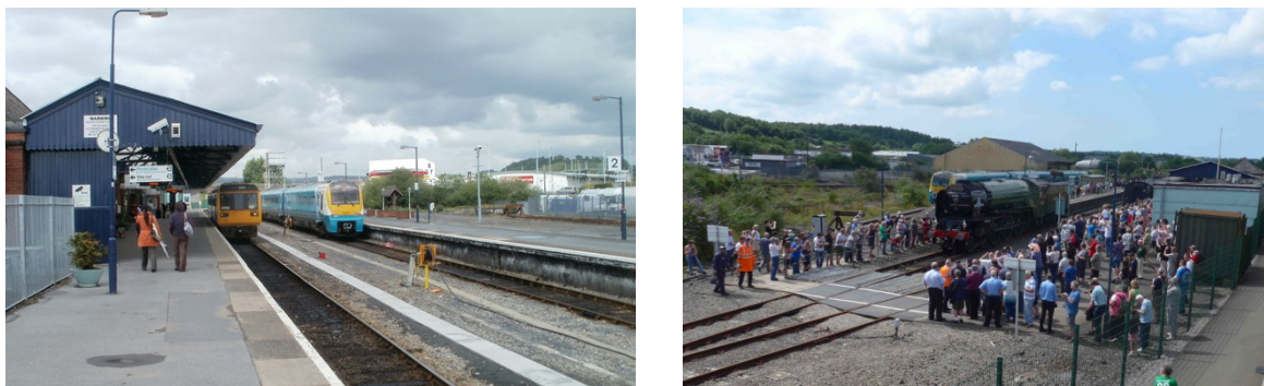
Figure 5. The southern terminus of the line at Carmarthen station. On the right is the station at the time of the visit of 60163 Tornado. Steam-hauled excursions frequently terminate at Carmarthen and attract large numbers of visitors to the town.

Transport Finance Plan, 2015. Moreover, the Feasibility Study acknowledged that good public transport connectivity is key to helping rural communities, who may experience deprivation as a result of fewer employment and education opportunities. Economic growth across Ceredigion and Carmarthenshire is therefore dependent on accessibility in terms of the highway network and access to public transport. The re-opening of the Aberystwyth to Carmarthen railway reflects the over-arching policy objectives as set out in these various documents, especially as several highlight the un-sustainability of car use.