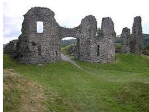
Figure 8. Tourist attractions in the Teifi Valley area: Strata Florida, a former Cistercian Abbey near Tregaron, founded in 1164 (left), and the ruins of Newcastle Emlyn Castle which was probably built by the Welsh Lord Mareddud ap Rhys around 1240 (right).