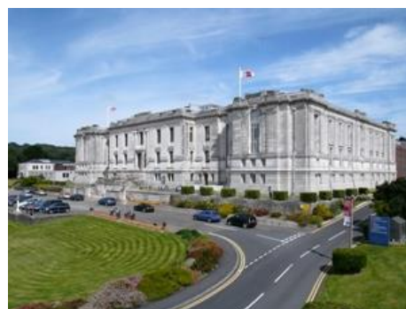
Figure 6. The university in Lampeter (left) and the National Library of Wales, Aberystwyth (right). Opened in 1822 as St David's College, Lampeter is the oldest degree awarding institution in England and Wales outside Oxford and Cambridge. It is now part of the University of Wales, Trinity Saint David. The National Library was founded in 1907 and is the largest library in Wales holding over 6.5 million books and periodicals.

In line with national trends, which indicate an increasing demand for rail transport, both Aberystwyth and Carmarthen stations have shown a marked increase in passenger footfall in recent years. Office of Road and Rail data show that for Aberystwyth, the increase has been 21.65% over the past 15 years (2018/19: 309,000; 2004/5: 254,000), while the figures for Carmarthen show a 30.4% increase (2018/19: 383,386; 2004/5: 294,000) over the same