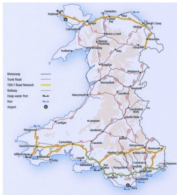
Figure 1. A road/rail map of Wales showing the large gap between Aberystwyth and Carmarthen with no railway connection and no major roads. This means that the whole area is particularly poorly served by public transport. From Welsh Infrastructure Investment Plan for Growth and Jobs, 2012. Welsh Government, Cardiff.

Unlocking this potential requires considerable inward investment, vision and planning, but a major requirement is a significant improvement in transport network, both within the region itself, as well as outward to the nearby urban centres of South Wales, the English Midlands, and Merseyside and Manchester. Poor transport connectivity and access to markets and services has been recognised as a major infrastructural weakness by previous economic assessments (see, for example, Framework for Action Plan produced by the Growing Mid Wales Partnership , 2016, and Rural Wales – Time to Meet the Challenge , 2017, by Baroness Eluned Morgan). Currently, the road system in Mid- and West Wales in particular is inadequate for the region’s needs, and while the existing railway links eastwards from Bangor and Aberystwyth, and east and west from Carmarthen, are both well-used, they do little to improve regional connectivity (Figure 1).